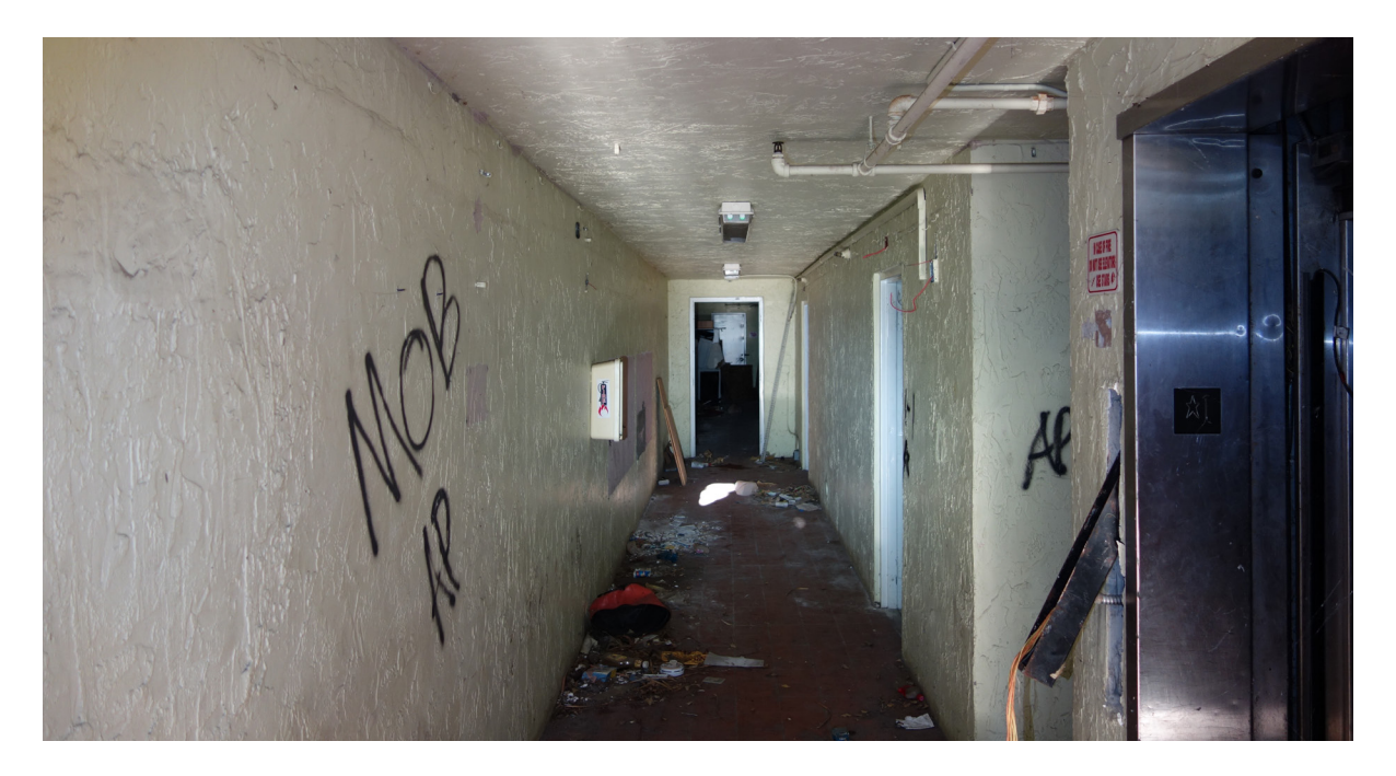
Interior hallway showing the state of disrepair

There are approximately 760 actively insured loans (the majority of which are in default) with an unpaid principal balance of $136 million.