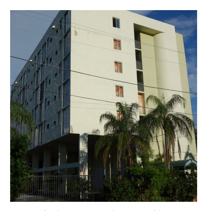
Exterior of Cedars Pointe complex in state of disrepair