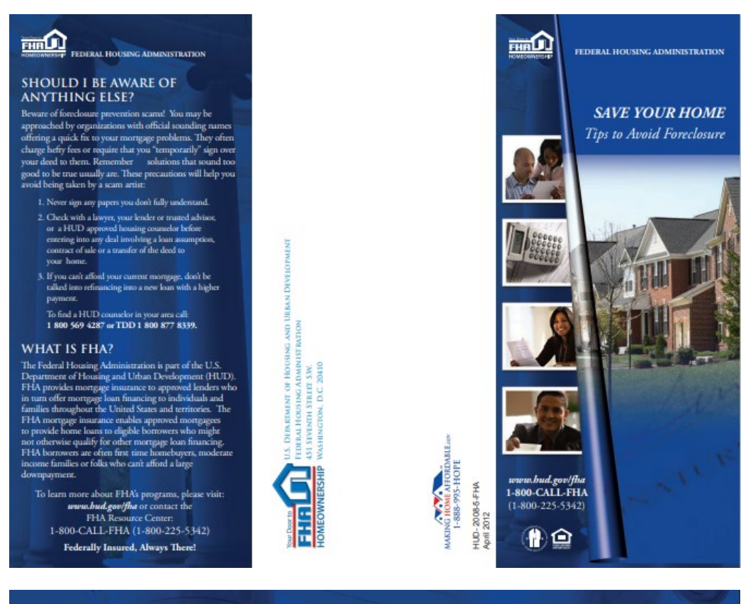
Illustration 4. Save Your Home – Tips to Avoid Foreclosure brochure