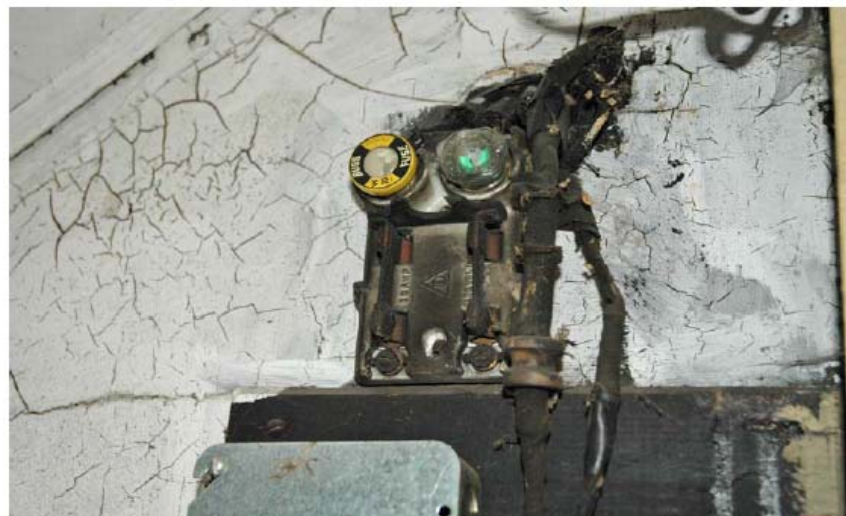
Household 9236: The fuse box on a basement stairway was without a cover and had exposed electrical contacts.

Fifty-eight electrical violations were present in 22 of the Authority’s units inspected. The following items are examples of the electrical violations listed in the table: outlets with open ground, disconnect boxes with exposed electrical contacts, ground fault circuit interrupters that did not turn off once tripped, exposed electrical outlets, and holes or gaps in a breaker box. The following pictures are examples of the electrical-related violations.