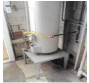
Water heater may not meet code requirements 10

According to Financial Freedom, it relied on an inspection report by the inspector; however, it did not provide the inspection report for review. HUD should consider taking administrative action against the inspector that inspected the work and require Financial Freedom to ensure that the incomplete items are repaired adequately.